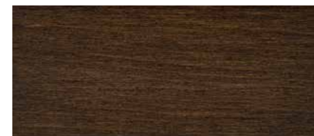
214 Walnut Dark