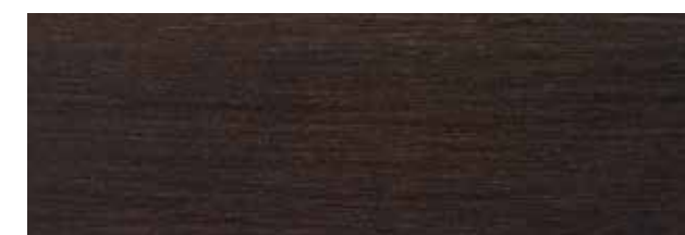
118 Dark Walnut