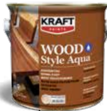
Decorative polyurethane water-based varnish