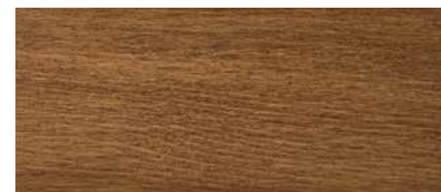
204 Walnut Light