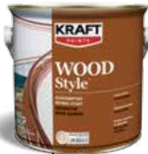
Decorative polyurethane varnish