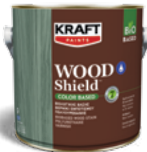
Bio based polyurethane wood stain varnish