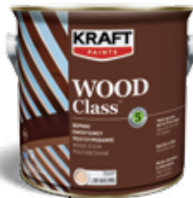
Decorative wood stain polyurethane varnish