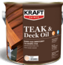
Impregnation oil for hard wood