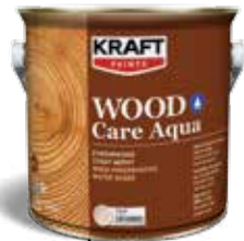
Water based wood preservative