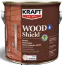
Water based polyurethane wood stain varnish